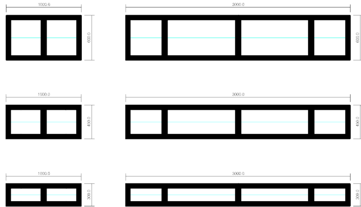
Rear view 1.50